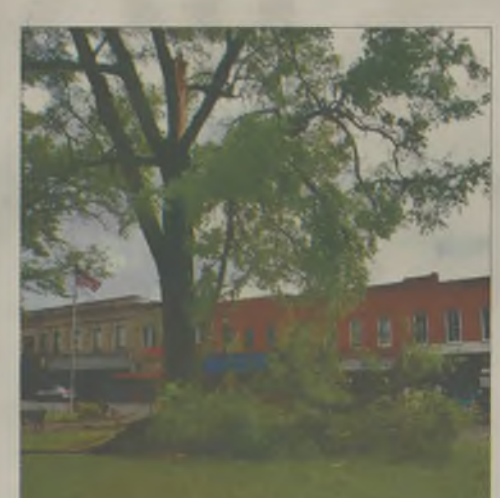
During a windstorm last week, an old tree succumbed to the elements in downtown Hertford.

Carolina Moon Theater, 110 W. Academy Street, on October 16 & 17 at 7 p.m. and October 18 at 4 p.m. Tickets will go on sale at