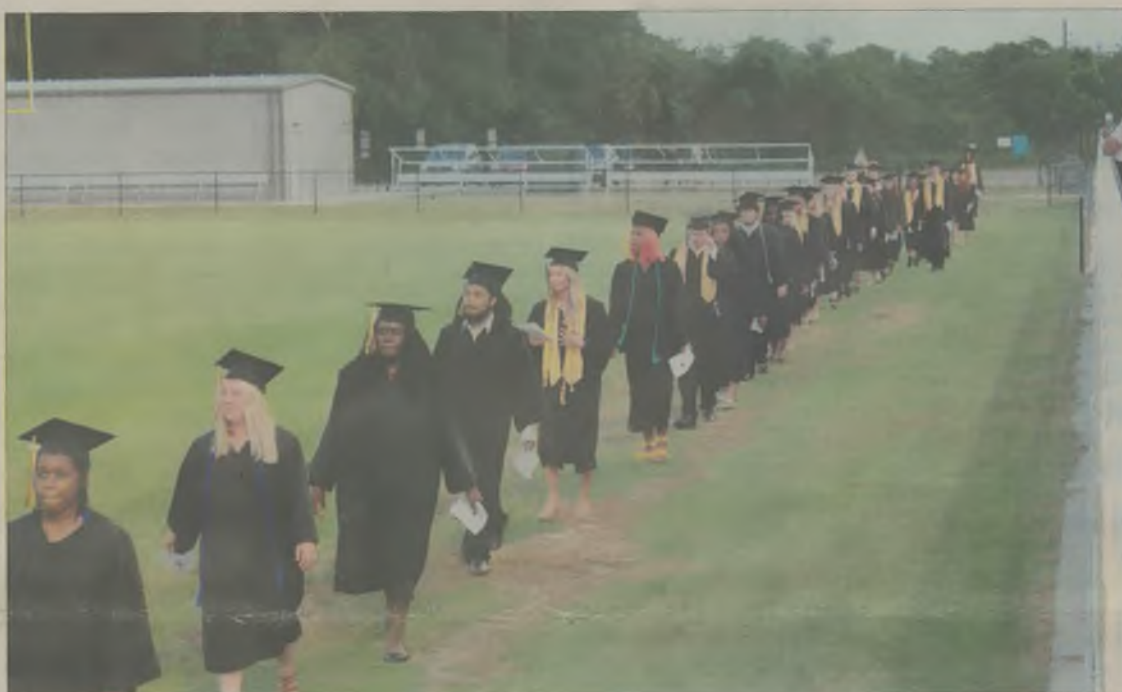
Maybe the most symbolic photo of the big day to come was from the baccalaureate service in June when the Pirates got to wear their commencement robes for the first time.

Due to late breaking news - very busy news cycle - a follow-up to the Perquimans Commission story about ongoing discussions about the future of the Confederate statue at the courthouse will have to wait until the next edition.