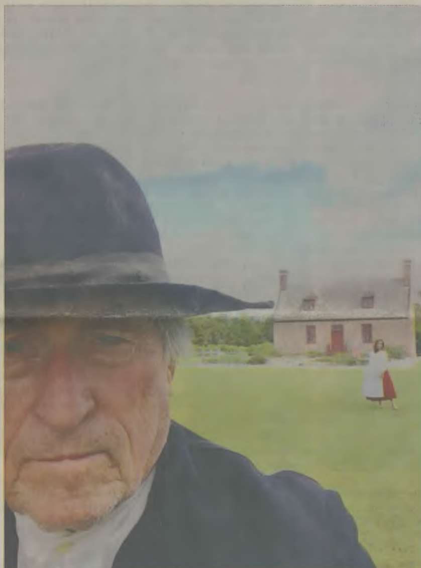
Glenn White at Newbold-White House; Best Picture of Newbold-White House.