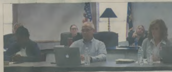
Perquimans Schools administrators met mid March to provide the Board of Education an update as to plans to provide learning access and distribute meals to students while schools are closed.