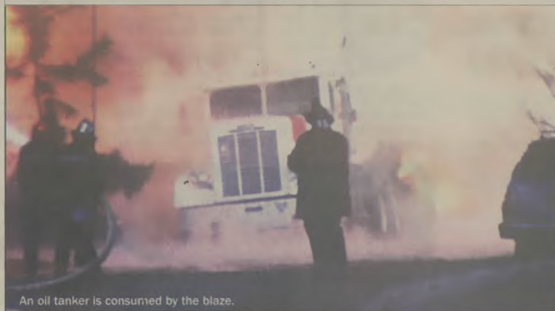
An oil tanker is consumed by the blaze.

To read stories about the big fire written 1978, see PerquimansWeekly.com Also, see the digital archive from January 1978 at https://www.digitalinc.org/newspapers/the-perquimans-weekly-hertford-n-c/