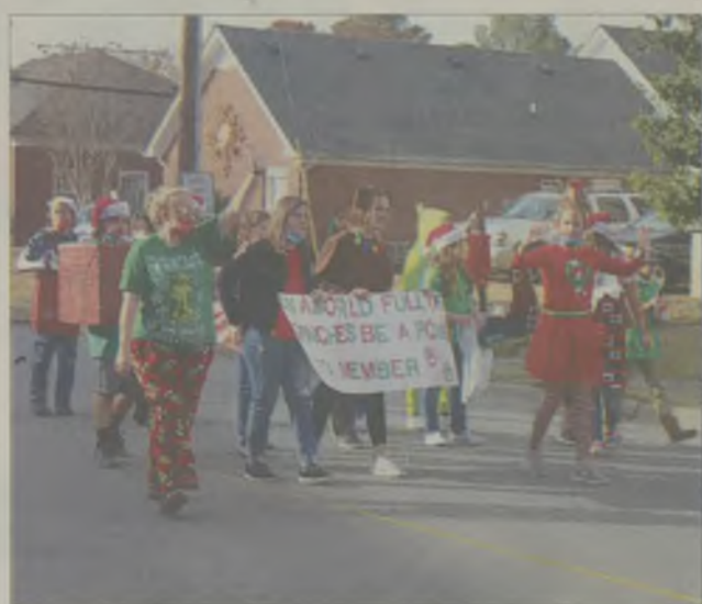
The FFA group from Perquimans Middle School marches in the Hertford Christmas Parade, Saturday.