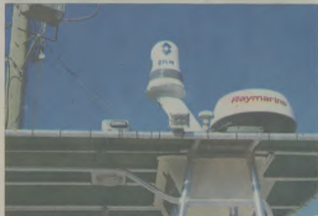
The Hertford Volunteer Fire Department's rescue boat is equipped with technology such as a forward looking infrared (FLIR) camera system and radar.