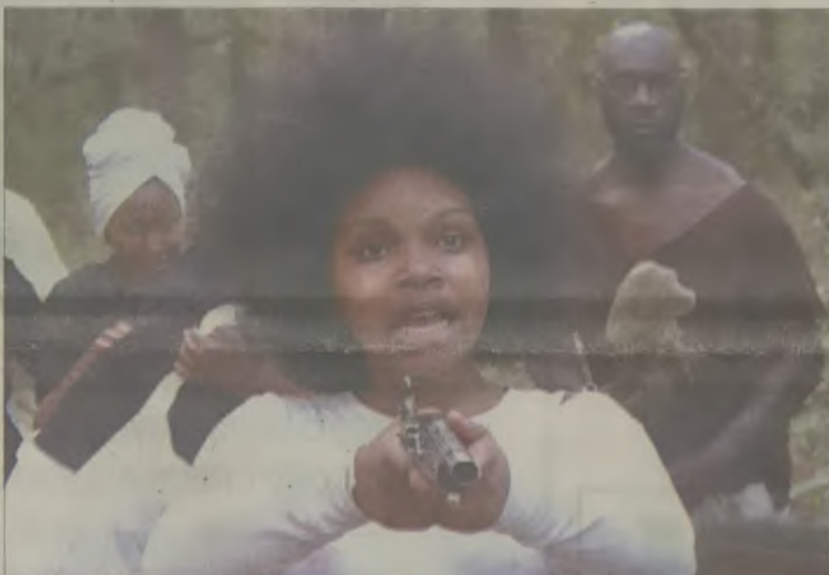
IMAGE STILL FROM 'FREEDOM OF NC'