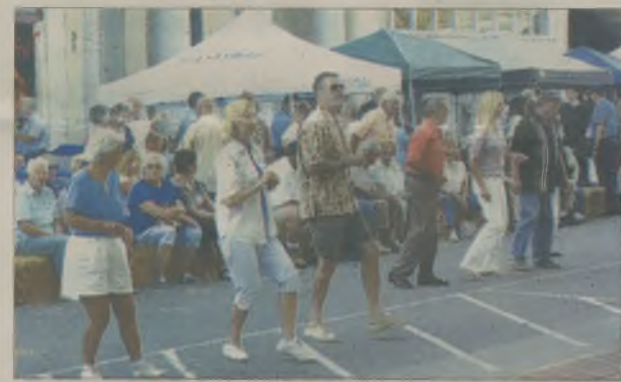
THE PERQUIMANS WEEKLY

A group of line dancers participate in the street dance at the annual Indian Summer Festival in this 2013 file photo. This year's festival will be Sept. 9-10.