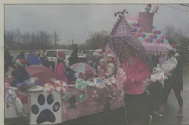
The Hertford Grammar School PTA's Candyland float rolls during Hertford's annual Christmas Parade in December 2022. This year's parade will be Saturday, Dec. 2, at 2 p.m.