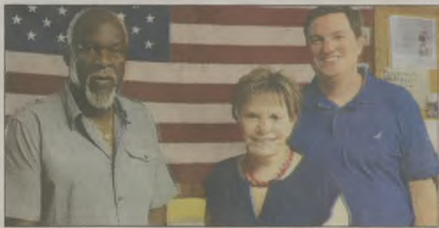
THE PERQUIMANS WEEKLY

"We have great schools, affordable property, state programs have made huge investments in infrastructure the past couple of years and we are seeing renovations all over town," Hodges said. "We love the small-town character and all the things that make it great. But we don't want to be complacent and we want to be looking to the future and new ideas."