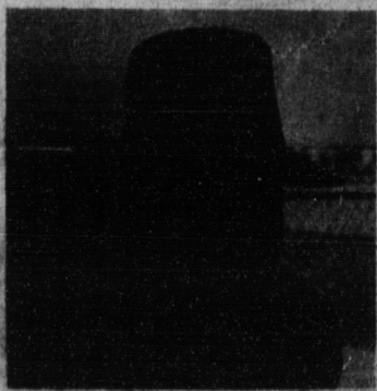
EMORY VANN No. 1 Weave Room

"I don't keep up too well with politics but it seems like Eisenhower is doing a good job. We're all waiting to see what the Republican Administration will do before saying anything final about it."