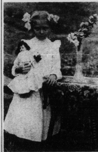
GUESS WHO?? She works in the Spinning Room on the 2nd shift.