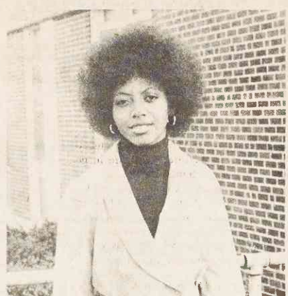
Miss North Carolina Central Univ.

Statutes such as the one in New York must not be confused with the one that was enacted by the General Assembly of North Carolina in 1951. Under this particular North Carolina statute proof of ownership of an automobile is merely prima facia evidence of a master-servant relationship between the driver and the owner of the automobile. The fact that the driver was not a servant or an agent at the time of the accident may be rebutted at the trial.