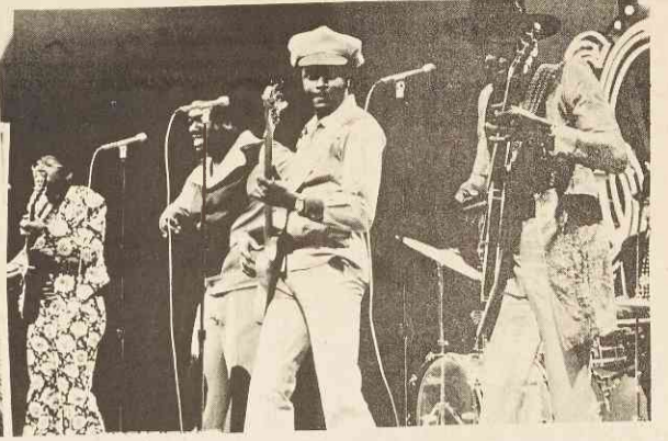
Main Ingredient Curtis Mayfield, left, & Don Cornelius Bloodstone