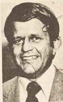
ROBERT "BOB" MORGAN ...New U. S. Senator

Even though Robert Morgan will not take his seat in the United States Senate until next month, he has managed, with the help of Senator Sam Ervin to help a North Carolina