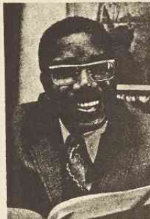
JULIUS CHAMBERS Chambers who established the first interracial law firm in North Carolina, was a key figure in the NAACP.

tion will continue with the same basic effort in court to challenge racial and discriminatory practices. There will be the same emphasis in schools, prison reform and other efforts." Chambers is the first Southerner to be elected president of the organization. The defense fund, established by the NAACP in 1939, now is a completely separate organization with a national staff and headquarters in New York City.