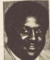
JOHN 'NIGHT TRAIN' LANE Cloverdale Ford