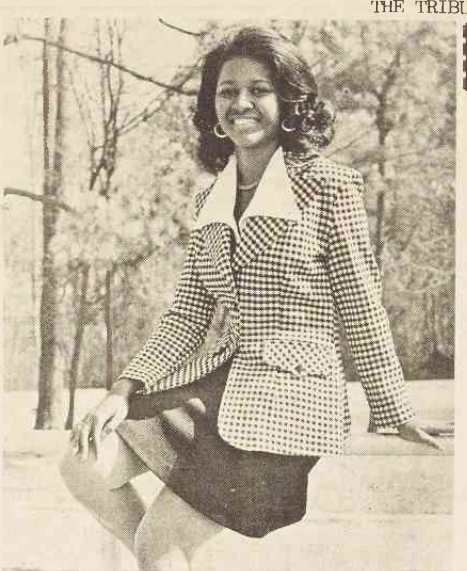
honor student majoring in math, she has made all "A's" twice at FSU and is a native of Salemburg, N.C.