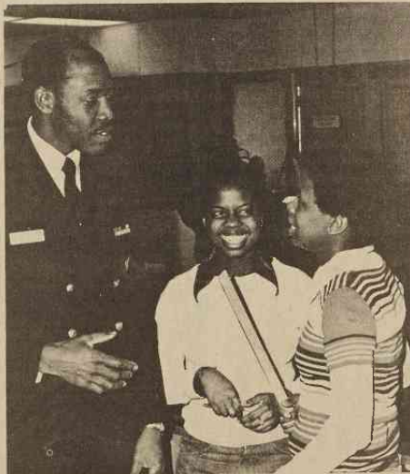
BMC Fair talks to some fellow students about opportunities in today's Navy.

Although only a small number of recruiters are enrolled in the program at this time, the District plans for additional enrollments for next semester. It's still too early to determine the success of the program, but NRD Washington recruiters feel the combination of matriculating and recruiting is a good approach to enlisting quality minority applicants.