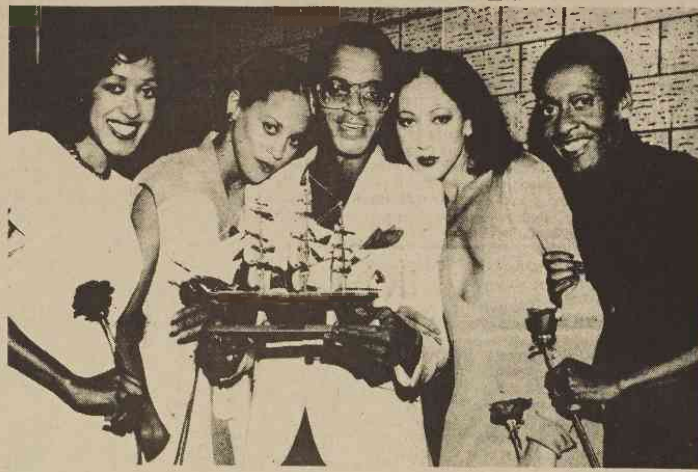
CUTTY SARK AWARD GOES TO STEPHEN BURROWS At a recent showing of fashions in New York, Stephen Burrows, one of America's leading fashion designers was presented with the Cutty Sark achievement award for his outstanding contributions to fashion throughout the world. Winner of the 1973