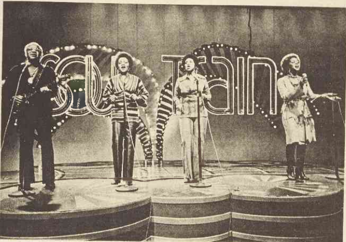
The Staple Singers

having composed the soundtrack for the film 'Across 110th Street.' The Soul Train dancers keep the pace lively with their fancy stepping down the Soul Train line. Produced by Cornelius. Soul Train is sponsored by Johnson Products Co of Chicago, manufacturers of hair care products and cosmetics.