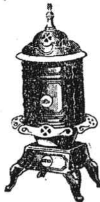
The 'Carolina' Oak Heater