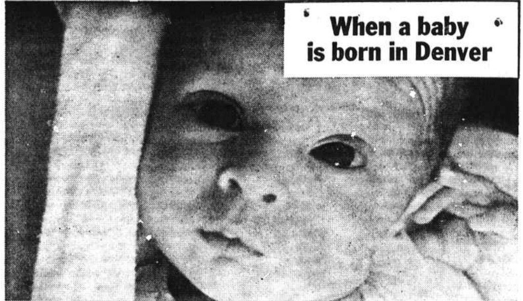
When a baby is born in Denver