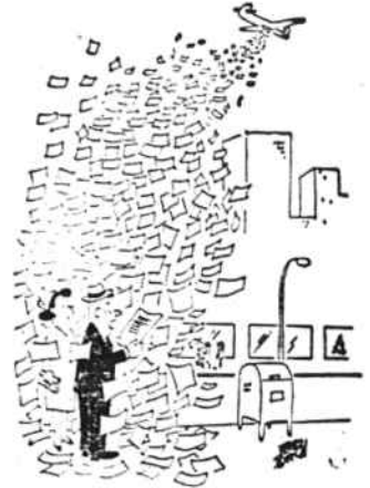
"It says: Every litter hurts."

STAFF PHOTOGRAPHER L. A. Wise 616 Benbow Road BR 2-4023