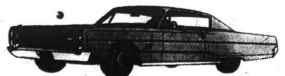
Plymouth Sport Fury 2-door Fast Top