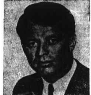
Robert F. Kennedy KENNEDY

After remaining in surgery and on the critical list at the Good Samaritan Hospital in Los Angeles, Calif. for about twenty-four hours, Senator Kennedy is dead.