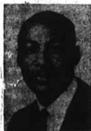
Young Ass't. Dir.