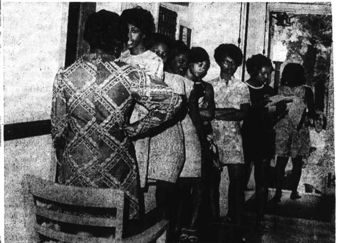
Bennett College Registration

Brown's Funeral Directors in charge of arrangements.