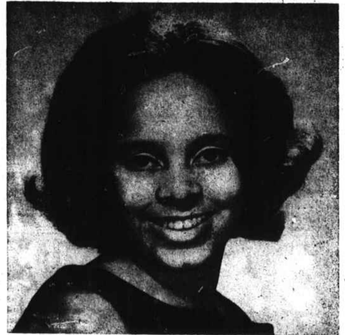
"MISS MARYLAND STATE" OF 1969-70