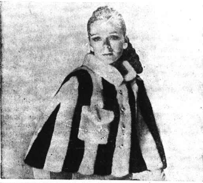
THE LADY IN MINK: the girl of the moment. Soft-spoken. Sweetly elegant. Wrapped in the little luxury of spring's mini-mink. Left: For graceful gliding, the bolero in the round, Alexandre's wonder-working in Jasmine Emba natural white mink, bordered from waist to collar for a gently curving line. Above: The chill-chaser cape, Ben Kahn's smashing striper in Jasmine Emba with dark Blackglama, patch-pocketed in today's casually chic young manner. Below: Petal-like curves form a petal-soft capelet, below a face-flattering cowl neck. The Brothers Christie work their bit of springtime magic in spring-sweet, blush-soft Rovalia Emba natural pale rose mink.

NEW YORK (ED)—Younger than springtime, apple-blossom soft . . . the mini-minks are the little luxuries that make a girl think spring. Newest, now, are the tiny wraps: just enough fur for graceful gliding, just in time for the return of The Lady to fashion's favor. No wild beasts, here. The Emba elegancies are bred to their calling: keeping a lady good company, through all the sweet sociabilities of this soft-spoken spring.