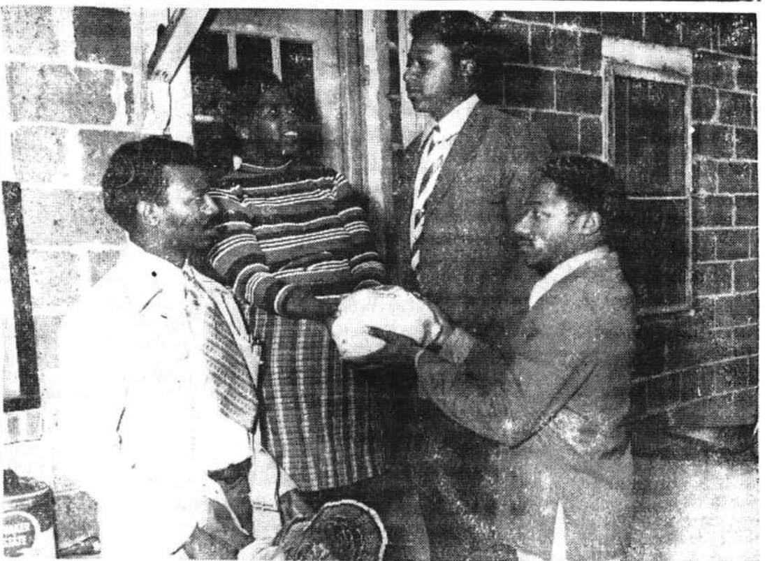
A&T AG Students Aid Guilford County Mother of 16

Brown's Funeral Directors in charge of arrangements.