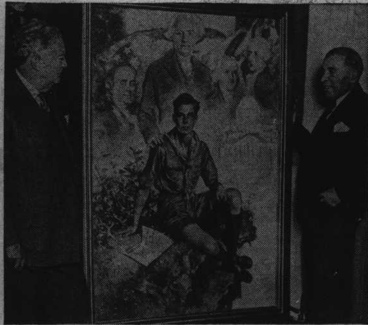
Howard Chandler Christy (left), noted artist and illustrator, pictured as he presented to Congressman Sol Bloom of New York, his poster of the "Ideal Boy Scout." The poster will be placed in every post office throughout the nation, as well as in other public buildings, in connection with the Boy Scouts' Jamboree of 1937, to which scouts will come from all over the world.