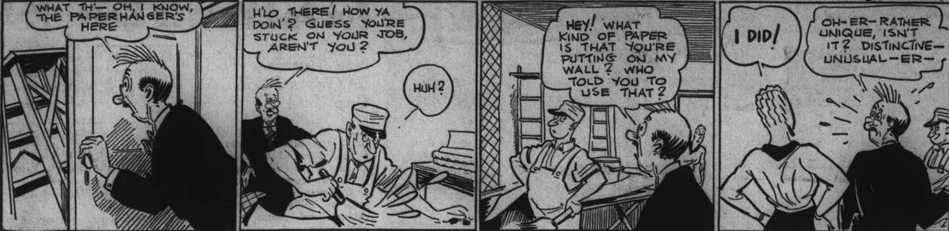
Figure It Out