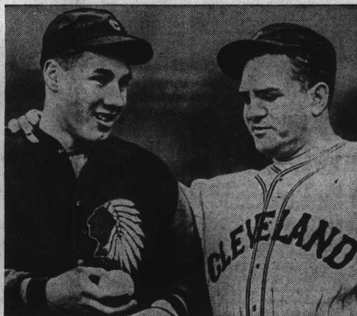
Bob Feller, eighteen, of Van Meter, Iowa, who holds the American league strike-out record for a single game, is shown with Steve O'Neill, manager of the Cleveland Indians. The sensational young hurler who was signed to a $10,000 contract hopes to have a record year in 1937.