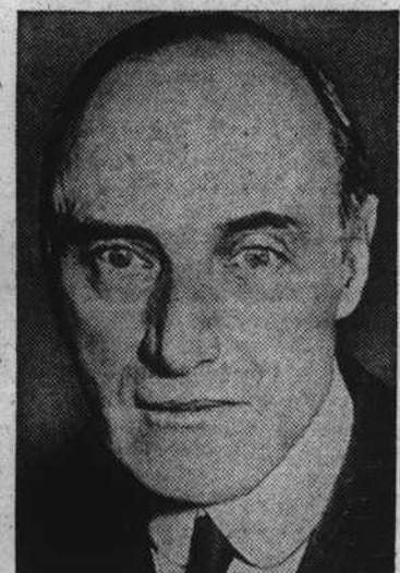
Viscount Swinton, secretary of state for air, who disclosed in parliament the plans of the British Royal air force for the defense of England and London from an air attack. To carry out the plan he announced that the personnel of the force would be increased to 70,000 officers and men with a first line strength of 1,750 aircraft.