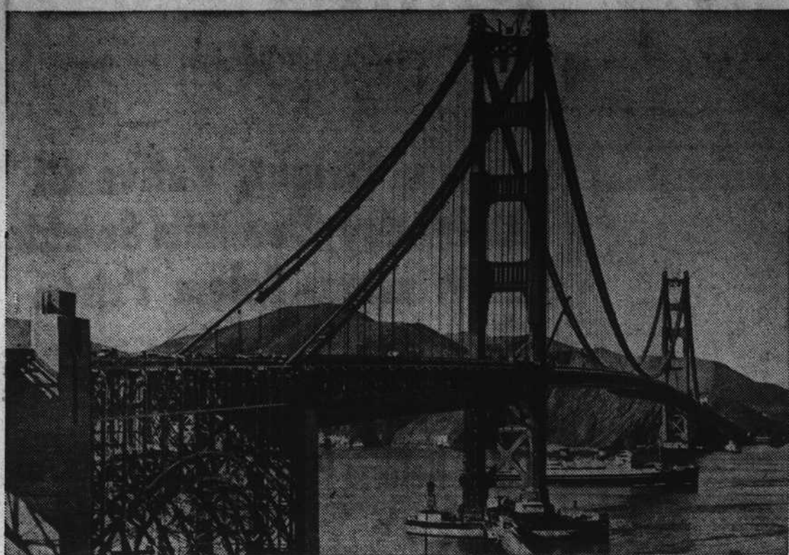
Heralding the approaching completion of the Golden Gate bridge, world's longest single span, the work of stripping away the catwalk construction on the west cable was undertaken. This photograph, taken from the San Francisco side, shows a portion of the catwalk that had already been removed.