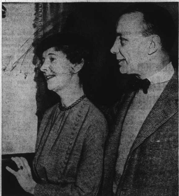
Col. and Mrs. Theodore Roosevelt shown as they arrived in New York recently aboard the S. S. Washington, after an extensive European tour, which included visits to important capitals on the continent.