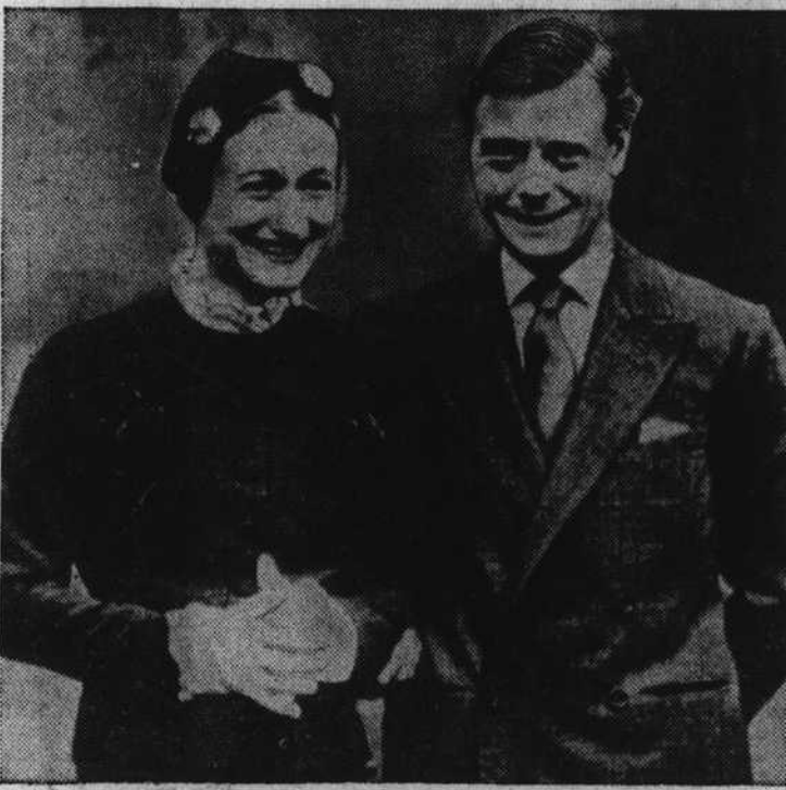
Picture of the duke of Windsor and Mrs. Wallis Warfield Simpson taken shortly before their recent wedding at Monts, France. This picture was posed on the lawn of the Chateau de Candé, where they were married. A religious ceremony performed by a rector of the Church of England followed the civil ceremony conducted by the Mayor of Monts.