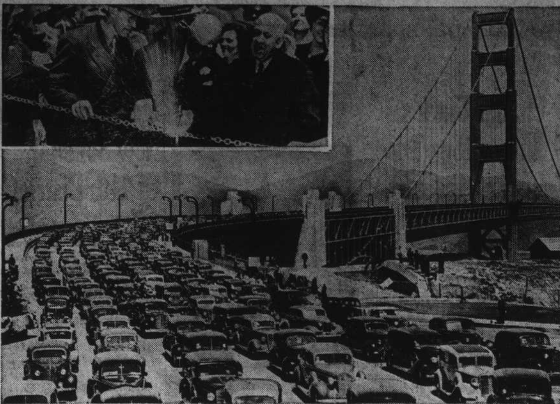
First automobiles shown arriving in San Francisco from Marin county across the Golden Gate bridge, following the recent gala opening of the span to motor traffic. Inset shows Mayor Angelo Rossi of San Francisco cutting a chain with an acetylene torch, thus officially opening the Waldo approach to traffic.