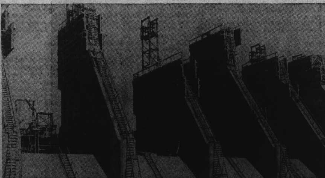
Like bones of some huge prehistoric monster the skeleton of the TVA dam at Pickwick Landing on the lower Tennessee river rises into the air, showing the recent progress of the work.