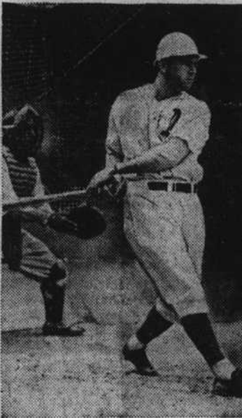
Wally Moses, outfielder of the Philadelphia Athletics, is shown at batting practice wearing a polo helmet, an adaptation of which is suggested as a protective measure against possible beaming of a batter by a pitched ball. The recent accident to Mickey Cochrane of the Tigers inspired the idea.