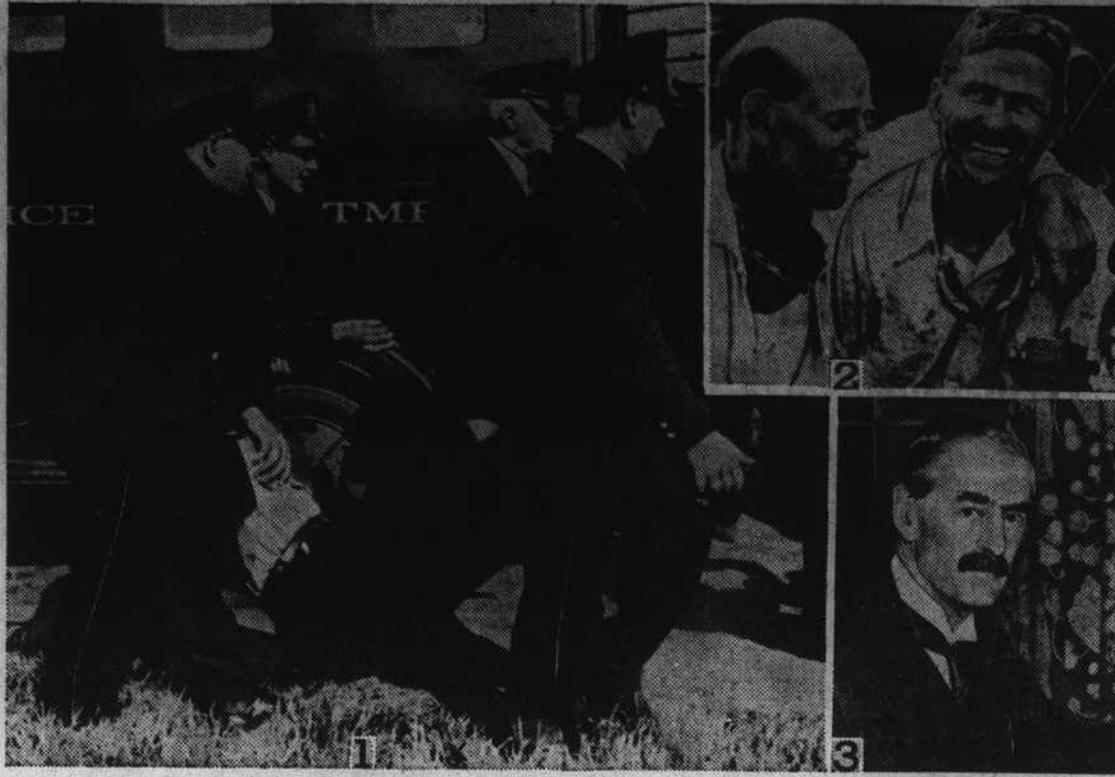
1—Police shown dragging a striker to the patrol wagon during fight between police and steel strikers in South Chicago recently, when five strikers were killed. 2—Wilbur Shaw, right, winner of the 500-mile Indianapolis Speedway race. 3—Neville Chamberlain, new prime minister of England, who succeeded Stanley Baldwin following the coronation.