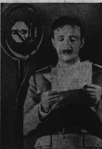
Celebrating the twenty-fifth anniversary of Albanian independence from Turkey, King Zog of Albania is shown before the microphone through which he addressed his subjects at the beginning of the festival that marked the event.