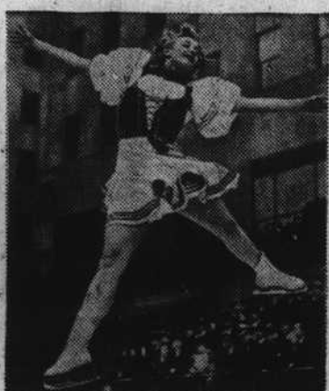
Vera Hruba, Czechoslovakian figure-skating champion, shown in action as she tuned up for her participation in a winter sports festival at Madison Square Garden in New York city recently.