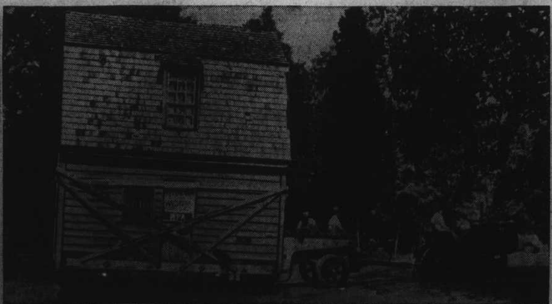
The humble cottage in which Andrew Johnson, who succeeded Abraham Lincoln to the presidency, was born, is loaded on a truck at Raleigh, N. C., and moved by WPA workers to its fourth site in its search for a permanent location. Originally the home stood near the state capitol, then it was moved to a location on East Caharris street and thence to Allen Park.