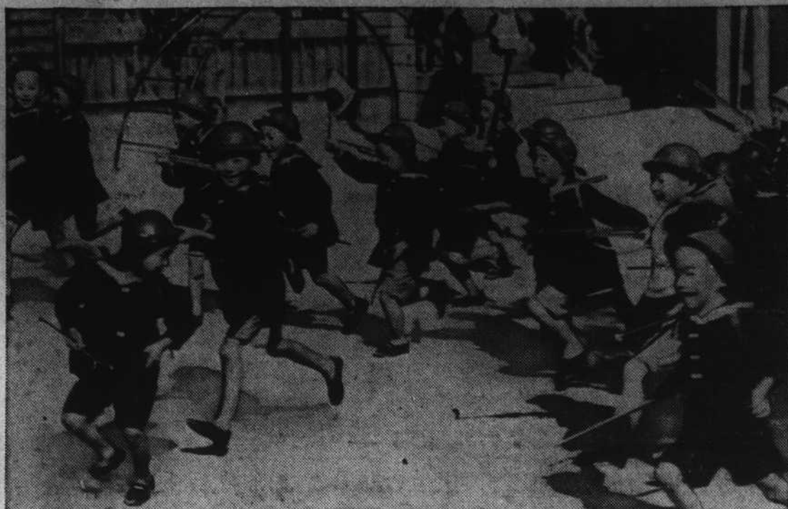
Wearing cardboard shrapnel helmets and carrying toy guns, these Japanese children are being instructed in the rudiments of warfare as part of their childish play. When the real thing comes along and they are old enough to bear arms for their emperor, they won't be altogether raw material.