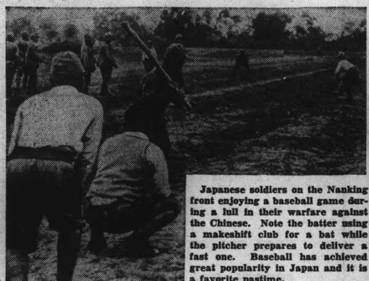
Japanese soldiers on the Nanking front enjoying a baseball game during a lull in their warfare against the Chinese. Note the batter using a makeshift club for a bat while the pitcher prepares to deliver a fast one. Baseball has achieved great popularity in Japan and it is a favorite pastime.