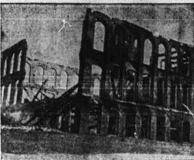
What was left of the Textile Building of A. & M. College at Raleigh which burned recently. The contract has been let for its reconstruction on a larger scale to be completed by August 1st, and manufacturers of textile machinery are being invited to again donate machinery for its equipment. The equipment for the burned building was donated in this way in 1901.