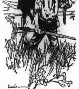
I Staggered and Reeled From Weariness.

"Yes, yes, I know; but I never thought of this; never dreamed of such a defeat. But there is no time to waste in talk. There is nothing to do but run for it now. Come, lass!" Before she realized what I was going to do, I had flung away my rifle and seized her in my arms. She was