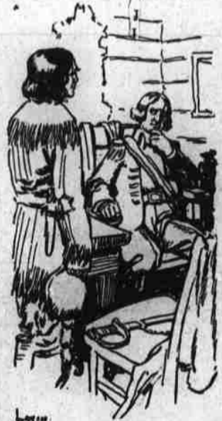
"The Cursed Hound; So You Were a Prisoner?"

We were up at dawn, but for no purpose, so far as I could see, unless it was to idle through a leisurely