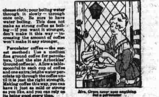
Mrs. Green says something to her percolator.

How to make Boiled Coffee: The way most people make coffee is: Be sure that the pot is clean. Have your coffee ground medium fine, just the size of 4 1/2 buckles' Ground coffee is. Allow one heaping tablespoonful to each cup of water, with one extra spoonful of coffee for the pot. Put the coffee into the pot, add cold water. Let boil until it is just the strength you like. Strain with a dash of cold water.