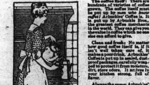
Mrs. Smith makes drip coffee.

The Drip Method: Have your coffee ground very fine, almost to a powder. Use only half a tablespoonful to a cup, with an extra one for the pot. (This method requires only half as much coffee as used for other methods.) Put the coffee in a piece of clean