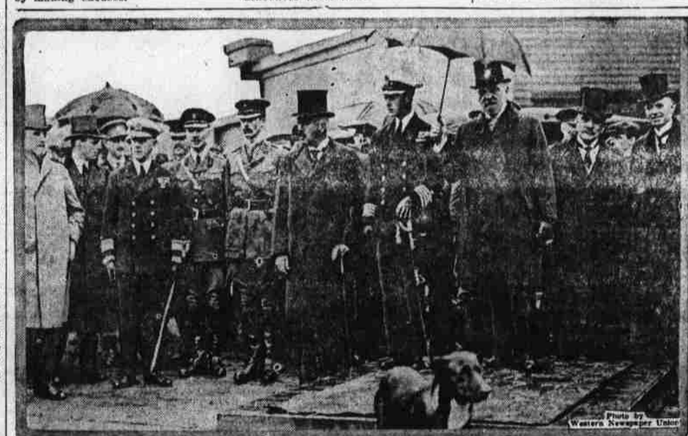
The prince of Wales, now touring America, is here seen listening to the singing of 1,200 Canadian school children. At his right is the duke of Devonshire, governor general of Canada.

FARM HELP WANTED —$40 per month; permanent jobs, board at cost, good quarters, gardens for families, only 12 miles to big city; good chance to acquire home easily. Golden Glades Farms, Miami, Fla. W. N. U., CHARLOTTE, NO. 38-1919.