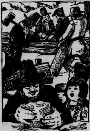
While the Little Nave Children Wished for Things.

The mortar to bind the stones was chiefly mud; to obtain even this simple ingredient it was necessary to build a fire in the middle