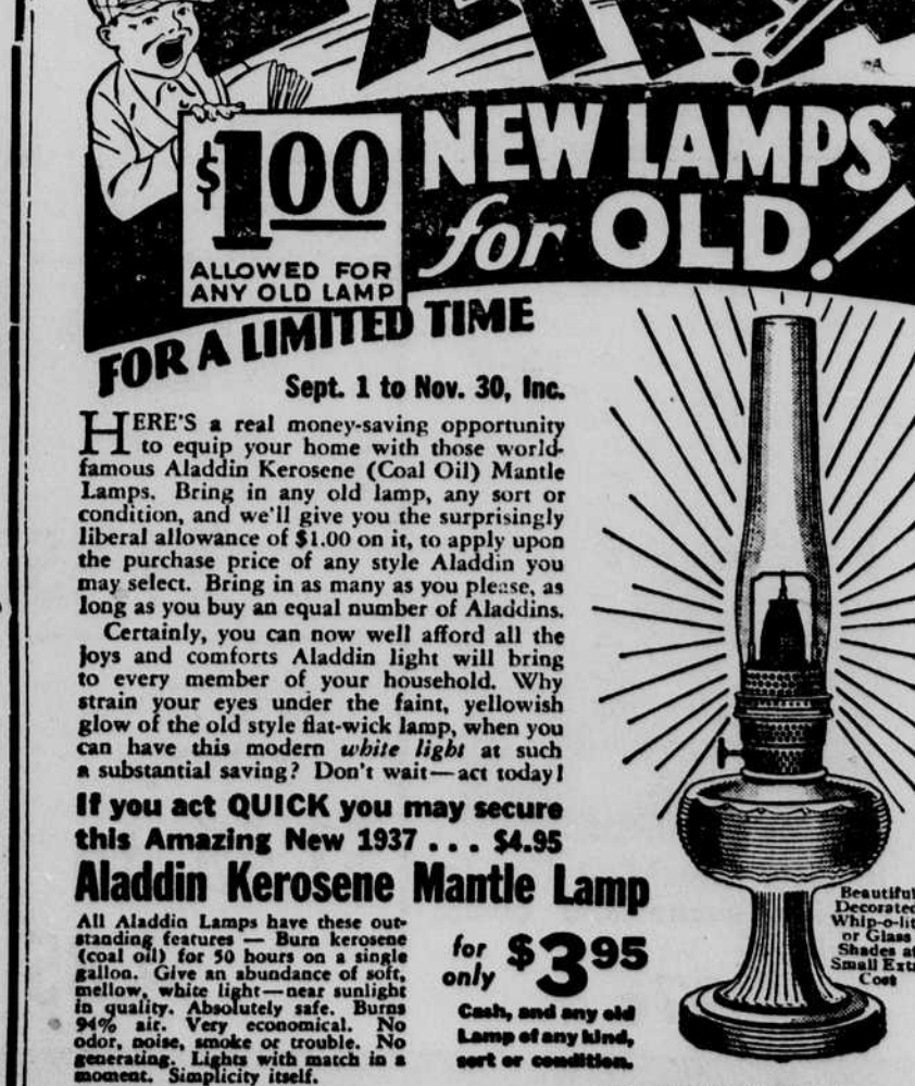
TABLE • HANGING • BRACKET AND FLOOR LAMPS In a Great Variety of Colors and Finishes from which to Change Bring in Your Old Lamp NOW! D. F. Hord Furniture Co<sup>-</sup>