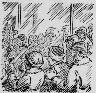
"That's What Attracted Attention," the Customer Said.

which went into the making that was the cause, she told herself. Her children had loved the sweet bits she had made for them at Christmas. Her children and grandchildren had outgrown such pleasures, but weren't there others who would enjoy those things? There proved to be many. And what joy it had brought her. No profit in money, but large dividends in joy—real Christmas joy—that of serving and giving happiness.