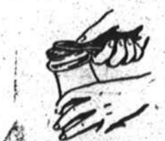
EASY TO OPEN The Dacro Cap is easily removed with the Dacro Opener which we provide.