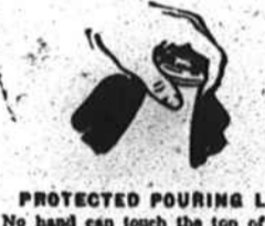
PROTECTED POURING LIP No hand can touch the top of this bottle, regardless of how it is handled.