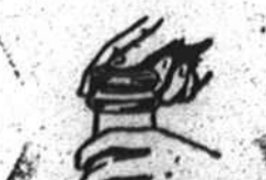
EASY TO RE-SEAL A tight groove in the hand seaps the cap back in place.