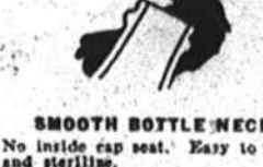
SMOOTH BOTTLE NECK No inside cap seat. Easy to wash and sterilize.