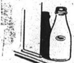
TAMPER-PROOF SEAL Securely locked in place on the bottle.

At every step from the farm to your home, special care is used to maintain highest purity and quality. The modern "Dacro Protected" Bottle is our final safeguard to make sure that all the benefits of this special care are carried right through to your home.