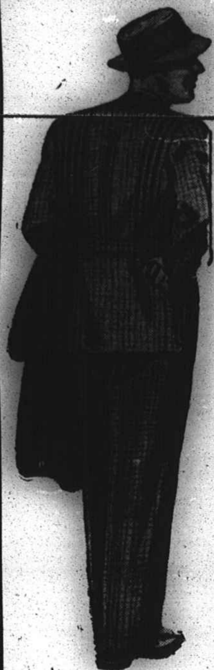
Men's Easter SUITS