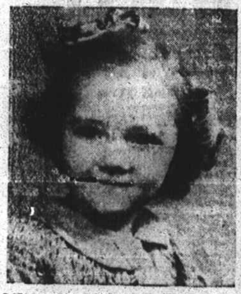
Thoras by Hora Studio, Shelby, N. C. Phonix MIII

FIRST COUNT SATURDAY NIGHT—BETTER HURRY! !