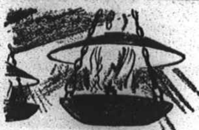
Before the Days of Electric Lights Steel plants used to be lighted by flaming oil torches suspended by chains from the roof.