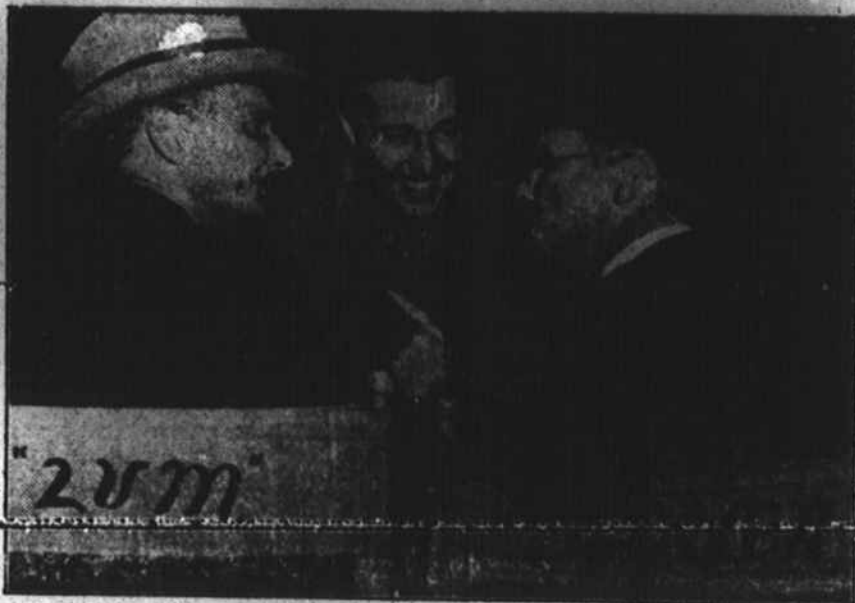
"Dreaming Out Loud"