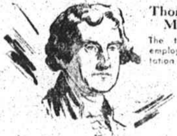
Thomas Jefferson Manufactured Nails The third American president employed 12 men on his plantation to make iron nails.